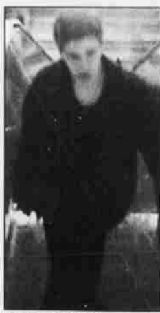
Police hope to speak to this man.

Police are appealing for further public assistance after reviewing surveillance tapes from the Anderson LRT station and several tips received in connection with an attempted sexual assault early Monday. Police are looking for a man described as white, in his early to mid-20s, five foot nine and 160 pounds with dark brown or black hair and clean-shaven. He wore a black leather jacket, blue jeans and dark shoes.